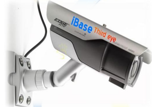
Authority Alert System