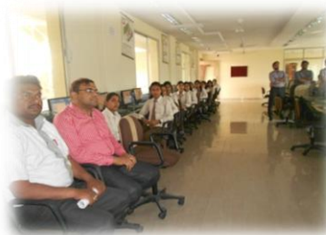
Android Workshop Amravati