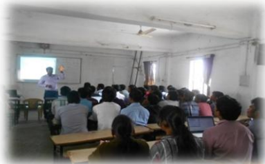
TPSI Program Hyderabad