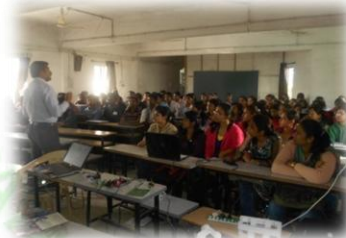
Skill Improvement Program Secunderabad

Successfully Conducted More than 100 of Training program & Workshops